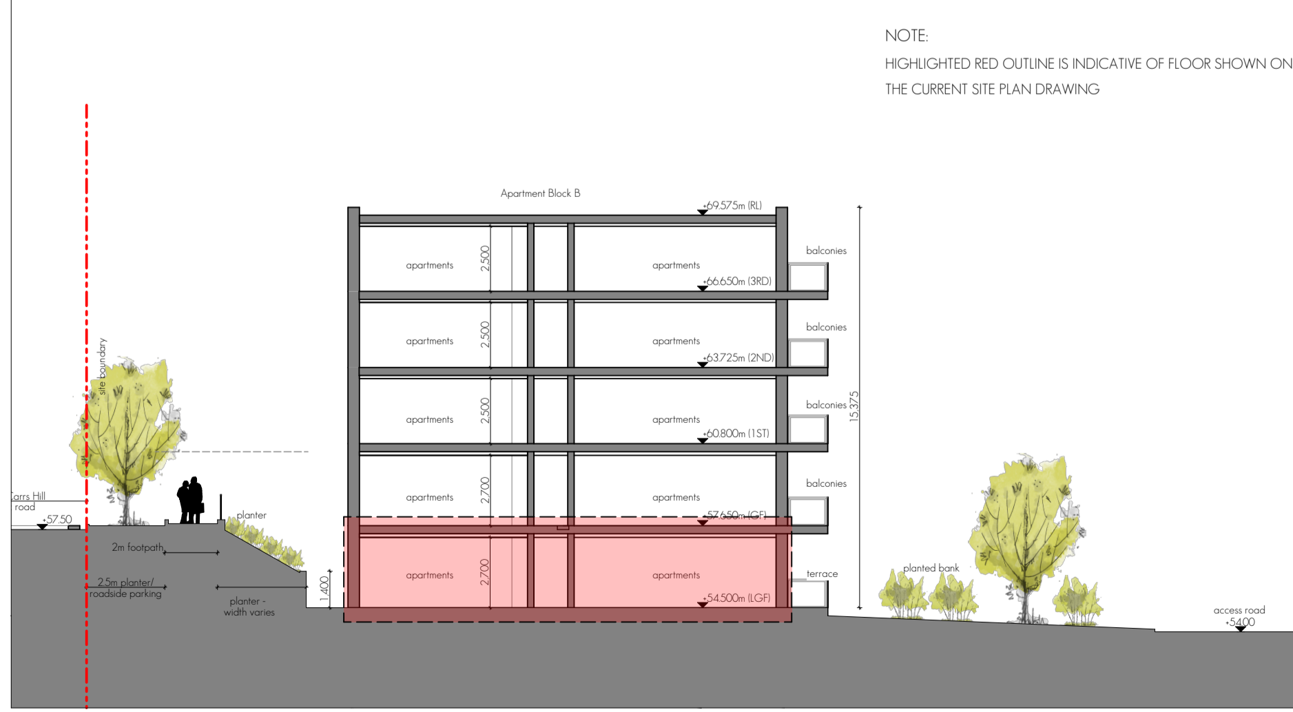
Section A-A 1:200

PLEASE REFER TO HQA REPORT 18205-REP-015, FOR ALL UNIT NUMBERS, ORIENTATIONS ETC